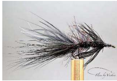
Vickie's Grizzly Bug

In the spring, the fishing can be spectacular as the trout are hungry, and every strike is aggressive. During this cloudy day, with a slight ripple on the water, the trout were feeding in the top few feet. My Grizzly Bug pattern proved to be especially productive.