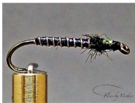
Vickie's UV Midge

If fishing in southern Oregon, Hyde Lake is the perfect addition to add to your travels. Since it is only 45 minutes from Pronghorn Lake, consider fishing both lakes your next trip to the area!